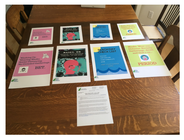
Outreach Flyers and Public Health Advisory for the Teen Outreach Campaign.

After approval by the health department, the volunteers and health department staff distributed these materials in various communities within Leelanau and Benzie County.