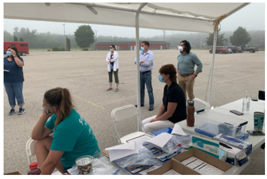
Team huddle before Community Testing Clinic at Benzie Central High School on June 21st, 2020

Strengthened relationships with local partners and agencies, preparedness plans, training exercises, amazing community volunteers, and temporary staff as well as additional state and local resources all contributed to the protection of our community.