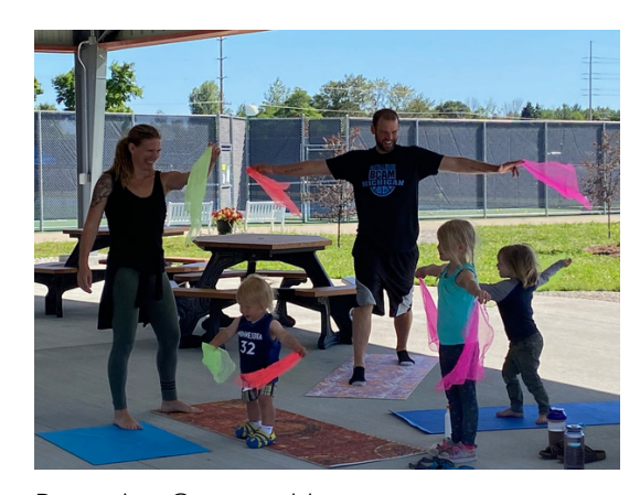
Parenting Communities yoga event playgroup held over the summer.