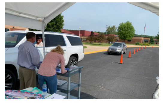
Community Testing Clinic at Suttons Bay School on June 20th, 2020