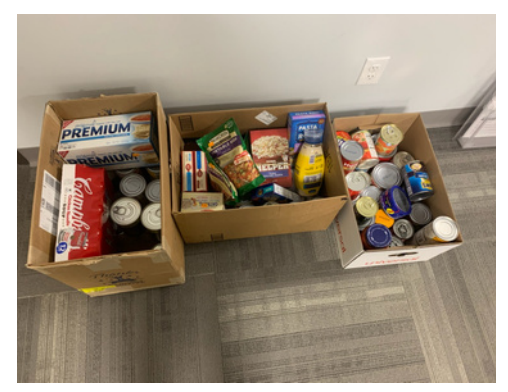
Benzie's National Radon Month "Give a can, get a kit" collected food that was donated to Benzie Area Christian Neighbors