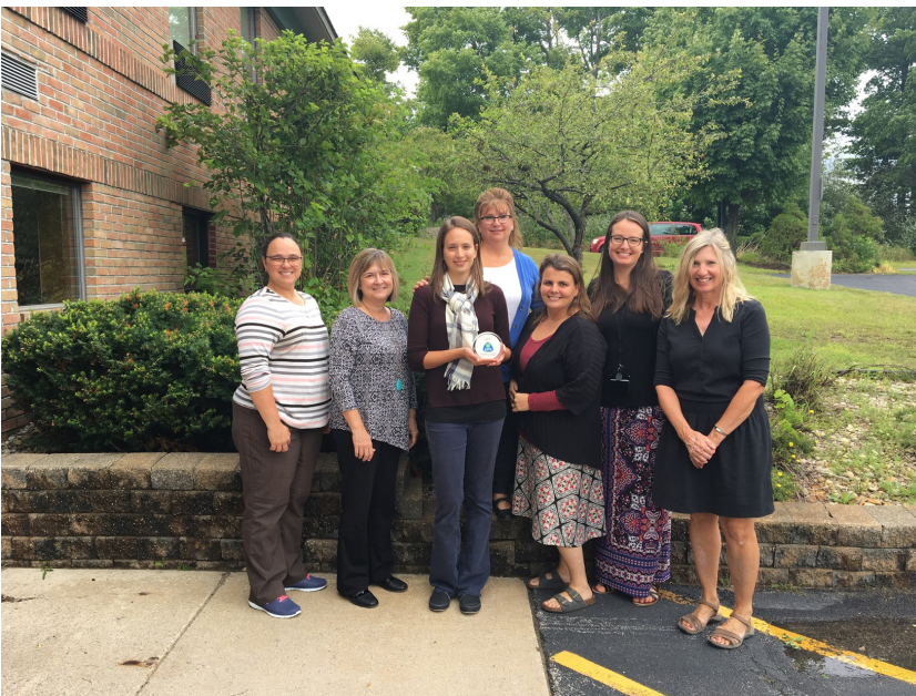
Photo: Community Connections Team with the 2019 Community Health Hero Award.