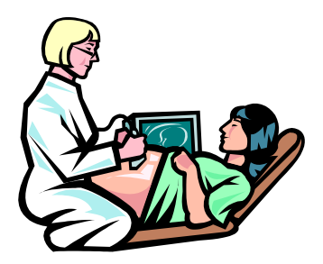
Health Department services to support healthy pregnancies include assisting 72 women with health insurance enrollment and 340 women with prenatal care coordination.

The Benzie-Leelanau District Health Department's focus on healthy pregnancies and healthy babies is achieved through the Maternal and Infant Support Services Programs, and through Healthy Futures.